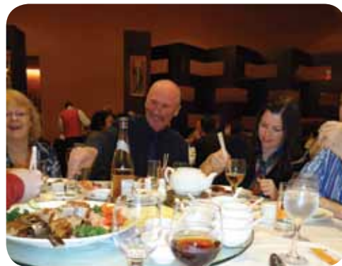
The LOVE, CARE, DREAM dinner hosted by the Vancouver Chinatown Lioness Club

Vancouver Chinatown Lioness Club organized and hosted the LOVE, CARE, DREAM dinner on November 6th for SOS Children and raised $11,500.