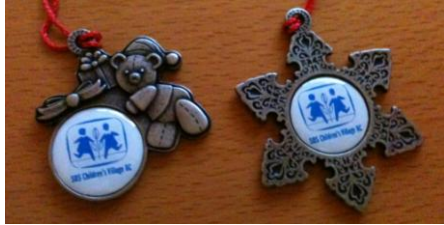
Christmas Ornaments $5.00 each